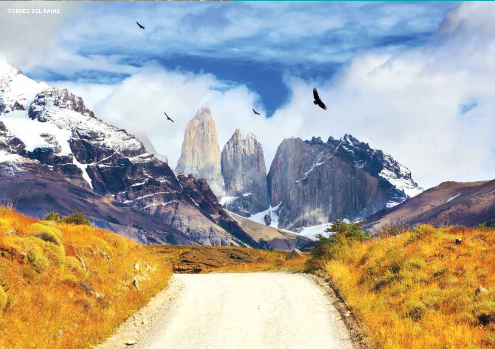
TORRES DEL PAINE